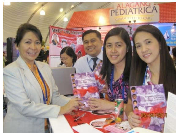
Awarding of winner for the Best Questions of the Day