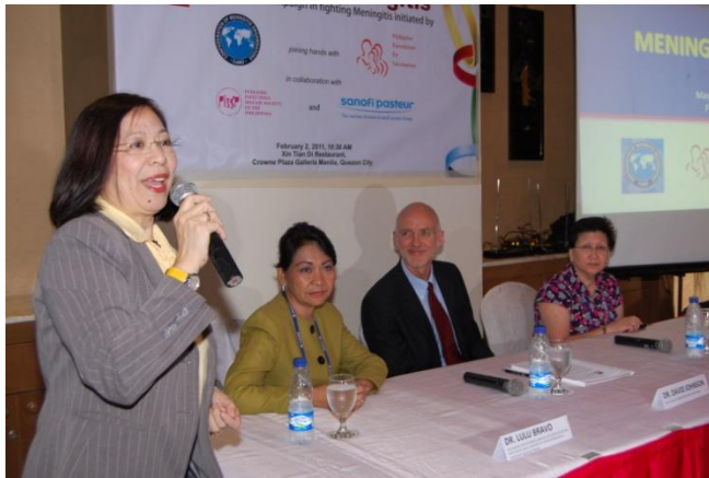
World Meningitis Day Celebration Kick off held at Crowne Plaza Galleria Manila, Quezon City last February 2, 2011

Meningitis is a serious disease that can affect anyone at any age and its impact can last a lifetime. The Philippines, along with other countries celebrated World Meningitis Day last April 24, 2011. To launch this event, PFV (Philippine Foundation for Vaccination) held a press conference last February 2, 2011 at the Crowne Plaza Galleria Manila, Quezon City during the PIDSP (Pediatric Infectious Society of the Philippines) annual convention. It highlighted the need to prevent meningitis and described the complications and burden of the disease.