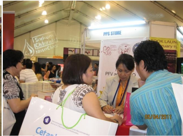
Distribution of EPI schedule, meningitis brochures and leaflets