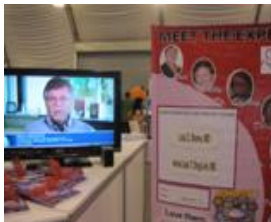
Podcast featuring meningococcal meningitis played during the entire duration of the annual convention