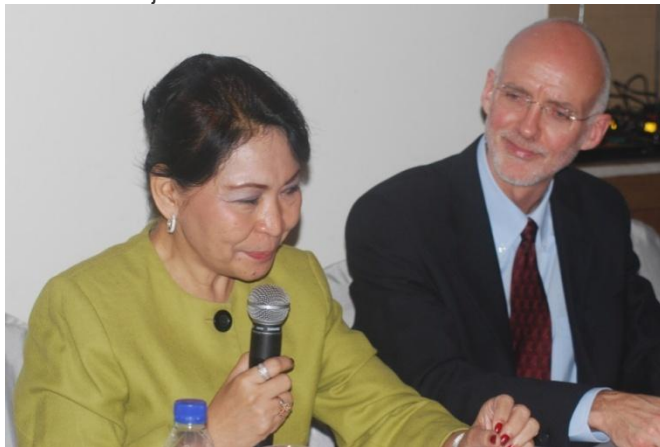
Prof. Lulu Bravo cheerfully answers press inquiries on World Meningitis Day and the importance of prevention of meningitis through vaccination